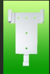
Optional Mounting Bracket