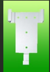
Optional Mounting Bracket